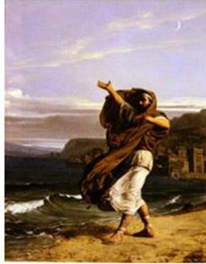
Demosthenes Practising Oratory (1870)

REM: Be sure to view the “Units of Analysis” slide deck above, and refresh your memory “Major Characteristics of American Anthropology”, and use that information to check the Units of Analysis that you are using for your Project . . .